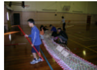
Its how long??

The Centre is most fortuitous to have acquired a 23-person dragon. This dragon will be used in parades and big performances. It will add a dimension to the club, which is new, exciting and visually spectacular.