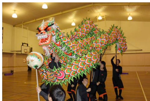
Practice up at the Centre