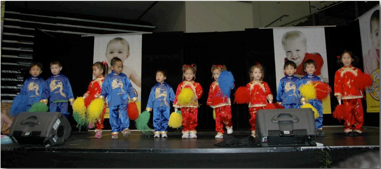
Children performing at the Parent and Child Show

social fish'n'chips evening for Wednesday and Saturday classes to mix and mingle. The children also performed well at the Parent and Child Show in June.