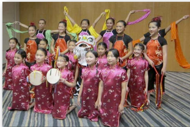
Tigers (11-12yrs old) and Dragons (9-10 yrs old) Dance group at the Nutri Metics presentation