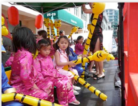
Children in the float for Chinese New Year parade with tiger face balloons!