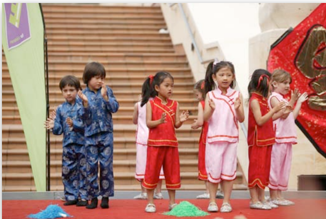
Ponies Dance group - 5-7 yrs old at Chinese New Year